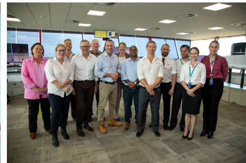
Prime Minister and Cabinet visit Port Hedland