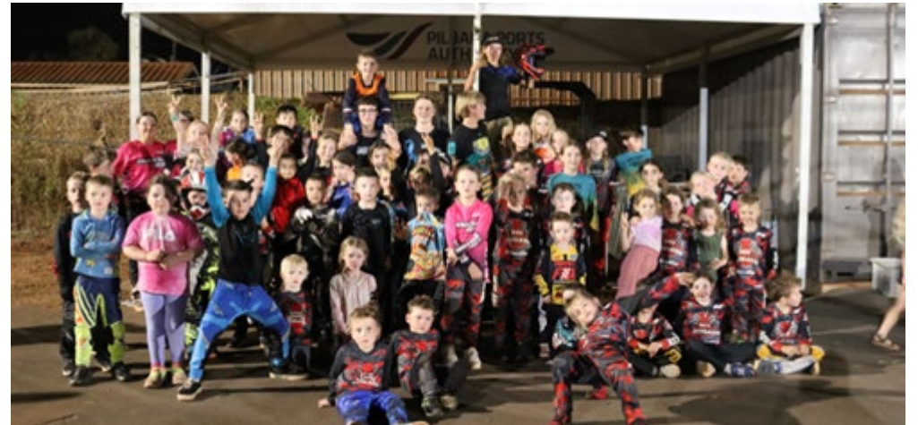
Port Hedland Industry Council Community - Industry Forum