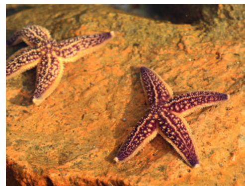
Northern Pacific Seastar.

Discovery of potential IMPs can be reported to Pilbara Ports Authority — 08 9173 9000