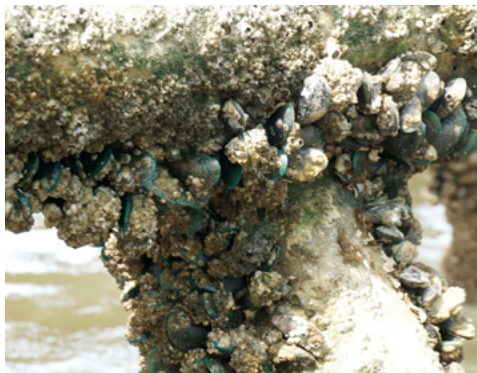
Asian Green Mussel.

No IMP that require intervention have been detected since the inception of the program.