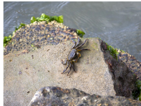
European Green Crab.