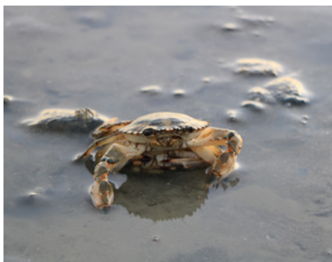
Asian Paddle Crab.