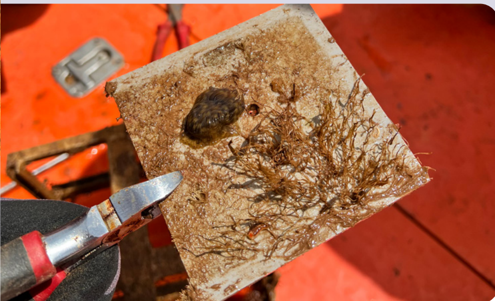
Marine growth on an array.

It is a world-first in the use of molecular techniques by a collaborative marine biosecurity surveillance network.