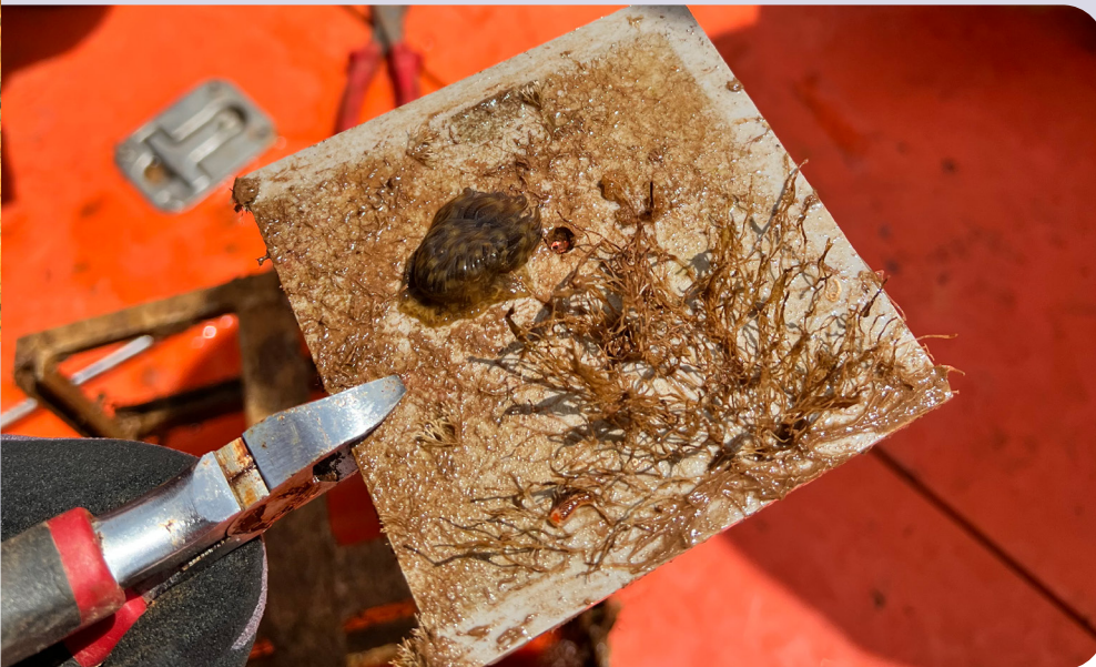
Marine growth on an array.

It is a world-first in the use of molecular techniques by a collaborative marine biosecurity surveillance network.