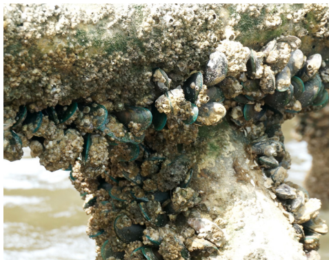
Asian Green Mussel.

No IMP that require intervention have been detected since the inception of the program.