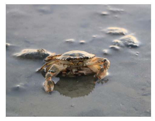
Asian Paddle Crab.